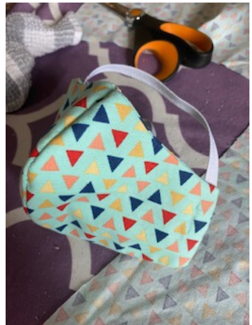
Cloth facemask made for COVID-19 Protection (Acadia First Nation).