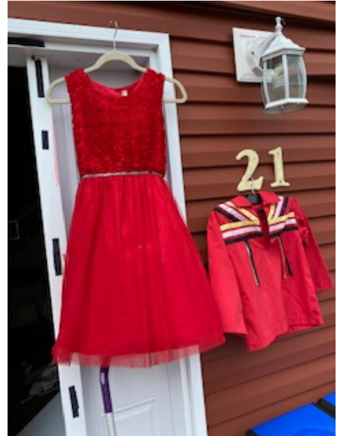
Red ribbon shirt and red dress on May 5, 2020 (Acadia First Nation).

A ceremony for MMIWG, men and family members was held on May 5, 2020. Red ribbon shirts and red dresses were hung in memory of our loved ones. Prayers for all our people.