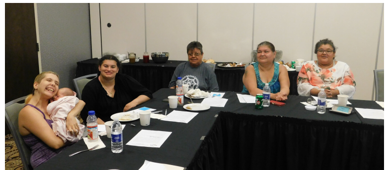
Community focus group in Membertou First Nation.

The NSNWA is currently working on developing a Five-year Strategic Plan , which will provide a structured approach to the direction of the association and set goals for our future. In creating the priorities and framework of the plan, the NSNWA is seeking input from our Chapters. Community focus sessions started in the Summer of 2019 and we have met with nine of the chapters to date. The remaining seven chapters will be done in a different format due to COVID-19 restrictions. The goal is to have all information collected by Fall 2020.