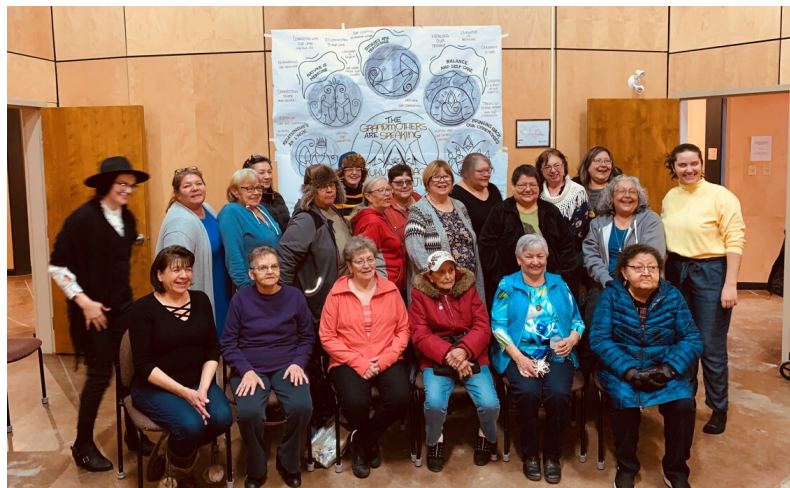
Gathering of the Grandmothers in March 2020.