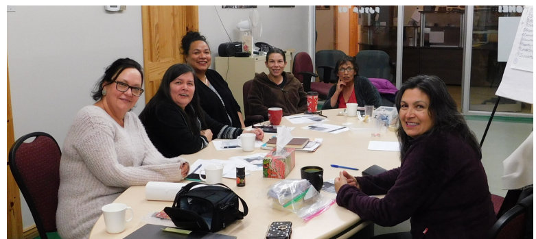
Community focus group in Bear River First Nation.