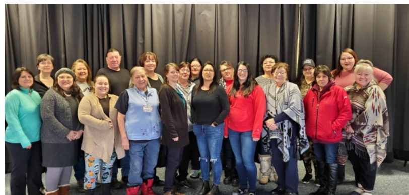
20 Mi'kmaq women at the End of Life Doula certification course on February 14th, 2020. The feedback from the participants in this program was very positive and they would recommend it to their peers.

I've been helping each of the chapters with setting up bank accounts. This helps the local groups with accountability and keeping track of their money. The chapters will also need a bank account in order to apply for grants and writing funding proposals.